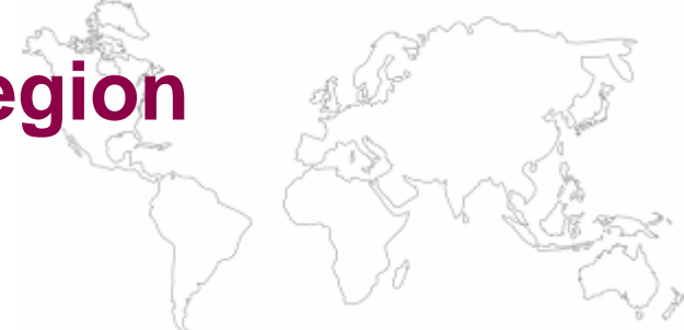
Engagements du Groupe AFD sur la zone Méditerranée - Moyen-Orient (M€)