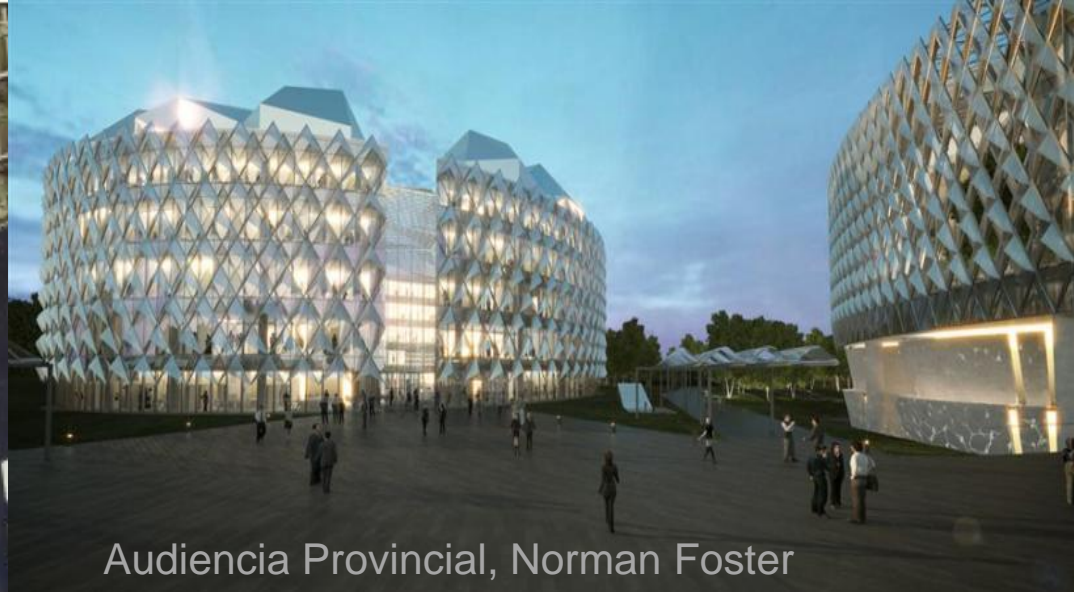
Audiencia Provincial, Norman Foster