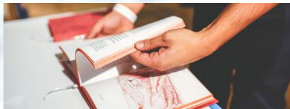
Culture for Development Task Force