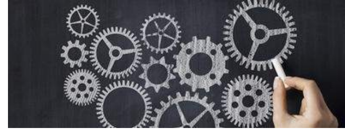
Contractual and Financial Framework