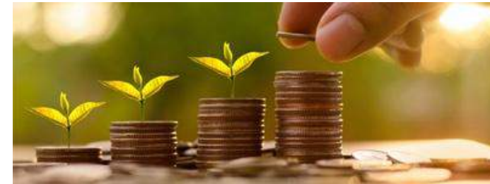
Cooperation with the Private Sector