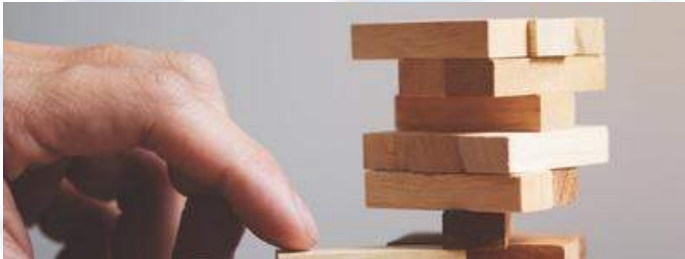
Crisis, Fragility and Migration