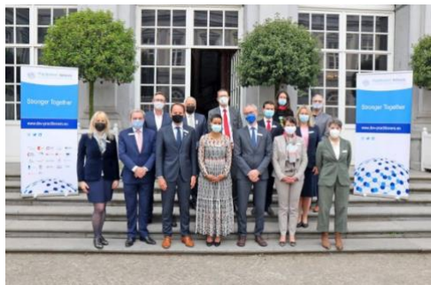
PN Member's CEOs at the General Assembly May 2021 in Brussel

The General Assembly is the main body of the PN. It meets at least once a year and is composed of all Members' representatives. The General Assembly is entrusted with strategy and budget decisions. iv PN